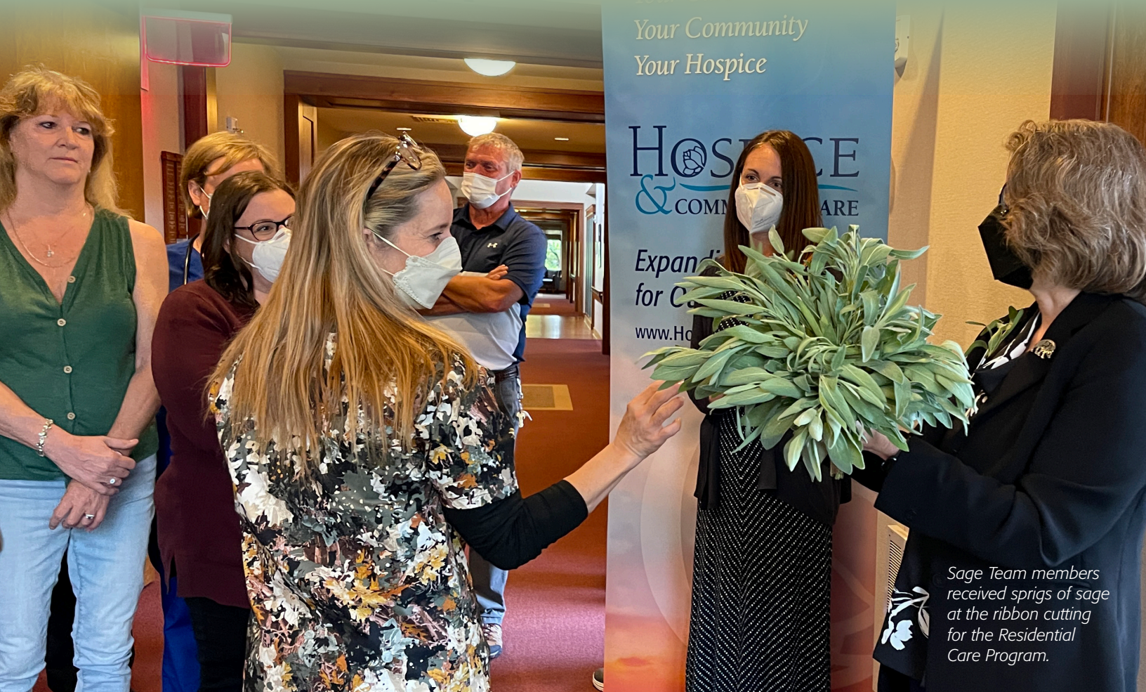
Sage Team members received sprigs of sage at the ribbon cutting for the Residential Care Program.

Assisting patients and families receiving inpatient residential care